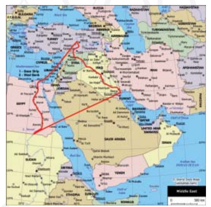
The Land Promised to Abram by God

Warbah Island where the Euphrates River empties into the Pursian Gulf. At this point we turn northward and follow along the western bank of the Euphrates River traveling just west of Baghdad in Iraq and continuing northwest toward Halab in Syria. The problem, at this point, is this: Do we turn back toward the southwest to meet with the mouth of the Nile Delta in Egypt or do we continue further north into the modern day country of Turkey to Lake Van and the head waters of the Euphrates River and then turn back to the southwest? Either way we must turn back to the southwest and meet the Nile Delta at Cairo and then travel along the eastern bank of the Nile River back to our starting point at Lake Nasser. That represents a vast amount of land and I feel few people really understand its size