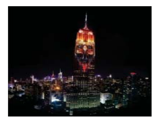
Fig. 4 Empire State Bldg. w/Kali