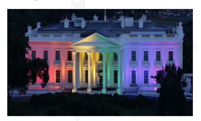
Fig. 3 White House lit with rainbow