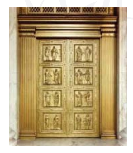
Fig. 2 Door at Supreme Court