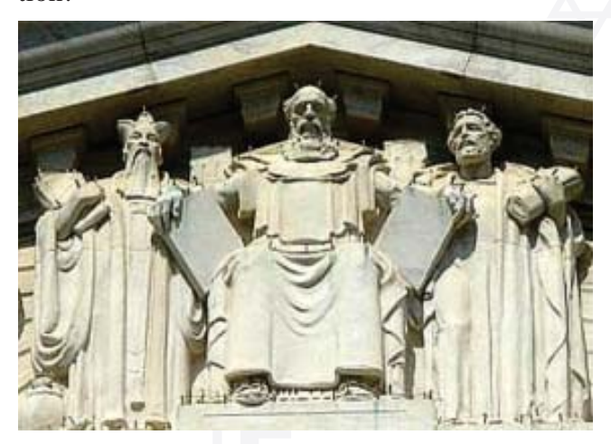
Fig. 1 Moses with Ten Commandments

Now the simple question is this: Do you now understand why the United States is listed as a hot spot? Do you now understand why God has lifted His hedge of protection and our place within God's grace has been removed? God is not pleased with this nation! The sleeping giant of Christian believing people must awaken and group together as a nation, not by denomination, for a serious revival. If this nation does not change its attitude toward God and each other, we could be headed for another revolution!